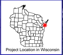
Project Location in Wisconsin